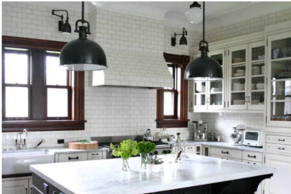
Carrara marble, a relatively affordable stone, tops the counters and island.

With nearly 16-foot high ceilings, Zaveloff was particularly careful not to go overboard. "If we'd gone too glam or too Victorian, it would have been too much," says Zaveloff. "We really tried to restrain and go more humble, more industrial."