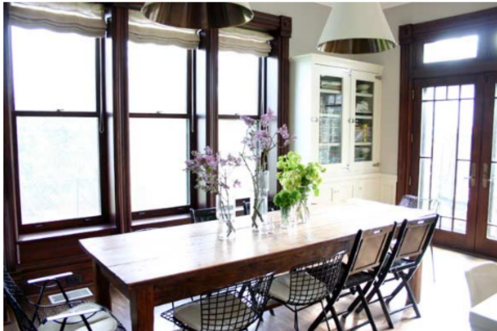
In the breakfast nook, a farmhouse table, mismatched chairs and soft Roman shades give the space a laidback feel. An antique hutch provides additional storage.

While this kitchen was custom built, Zaveloff encourages homeowners with existing wood cabinets to break out some paint and brushes to refresh their cabinets. "You may want to wait to remodel, but that day can be so far away," says Zaveloff. "Rather than living in a space you can't stand, why not try painting and putting effort into it?"